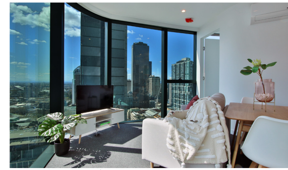
Market Avg $780 pw = Gross return 5.8%