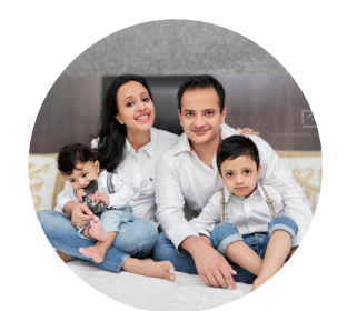
STEP 3 Live Happily Ever After

Live in your dream home or rent it out for high yield